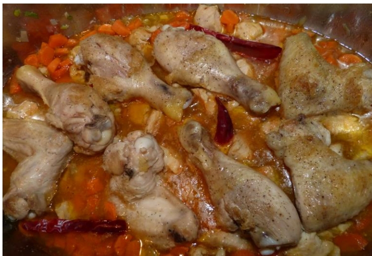
Coq au Vin de Pomme in statu nascendi

diced shallots and two diced garlic cloves. Cut 4 carrots into slices and add a red quartered chilli pepper, fill up with 700ml cider and 200ml cream, add two Alnatura chicken stock cubes and 30g tomato paste and bring to the boil. Add the chicken legs and wings again and simmer for about half an hour at low heat. Meanwhile, quarter 250g of fresh mushrooms, sauté in olive oil and add to the roaster with two tablespoons of honey. Season everything with salt and pepper, add chopped parsley, thicken if necessary. Serve with spaetzle or baguette, salad goes well with it.